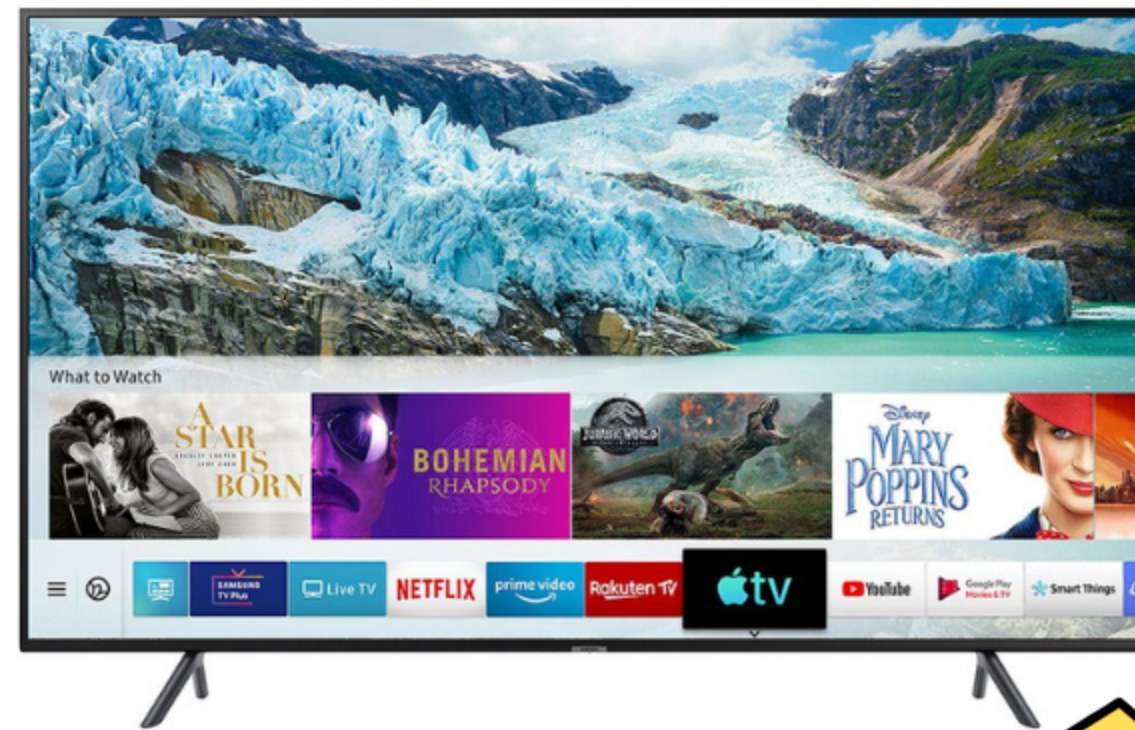
Samsung 55" HDR Smart 4k TV SA55RU710 Pay upfront cost £479